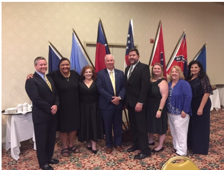
SSCA Executive Board Members at the Annual Awards Banquet on July 23, 2019.