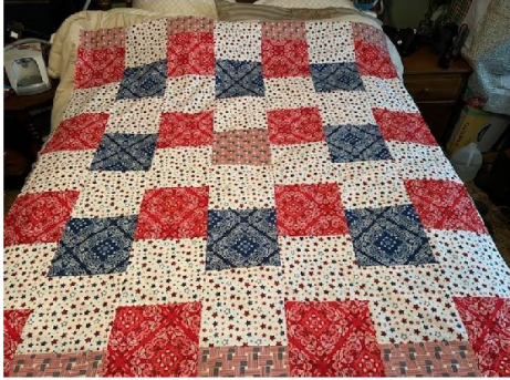
GORGEOUS HOMEMADE QUILT (REVERSIBLE)